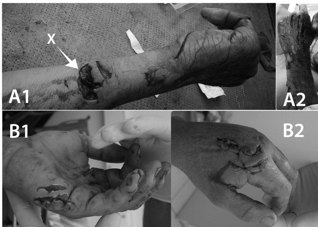
Figure 3: (A) Photographs (before surgery) of the 2004 bite on the left hand, showing (A1) the impression of the teeth from the lower jaw that caused a deep wound the forearm (X) for providing support as the teeth from the upper jaw tore flesh from the top of the hand (A2), leaving parallel prototypic wounds for dagger like shark teeth. (B) Photographs (after surgery) of the 2008 bite on the left hand, showing (B1 and B2) two major parallel elongated wounds left by two contiguous teeth in both sides

- Accident 2 also occurred at the Opunohu site on June 2008 and involved the same dive master. The bite took place during a morning dive ( ca. 08:00) as the victim was involved in an underwater photo session, at a depth between 15 and 20 m. The site was under a normal South-easterly swell < 1m, with a good visibility (> 15 m). Three to four Lemon sharks were quietly swimming (without appearing nervous) around a cage (containing fish bait) that was lying on the bottom. The dive master was positioned about 10 m from the cage, focusing on a marine turtle in the water column that he wanted to photograph. He was not wearing gloves and held his waterproof camera housing with the right hand as his left hand was holding the strobe at the end of a metal arm. As he was moving his hand in order to properly position the strobe for the next photo, a 2.5 m TL male shark came from behind him and firmly grabbed his left hand for few seconds. It took two attempts to extract his hand from the shark's mouth. The bite left relatively superficial wounds on the top and the side of the left hand, with no lasting after-effects following surgery (Figure 3B).